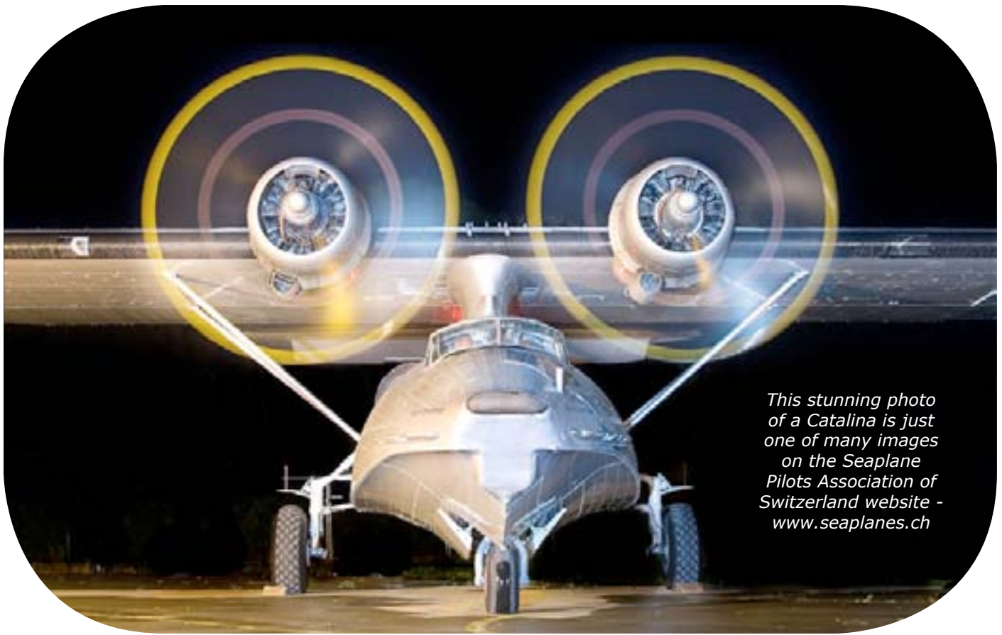
This stunning photo of a Catalina is just one of many images on the Seaplane Pilots Association of Switzerland website - www.seaplanes.ch