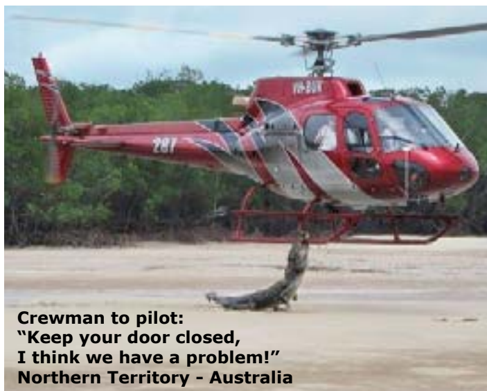
Crewman to pilot: "Keep your door closed, I think we have a problem!" Northern Territory - Australia