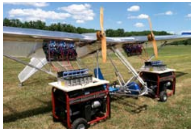
Charging the batteries of the electric Lazair

See the complete story and video at http://blog.cafefoundation.org/?p=3764