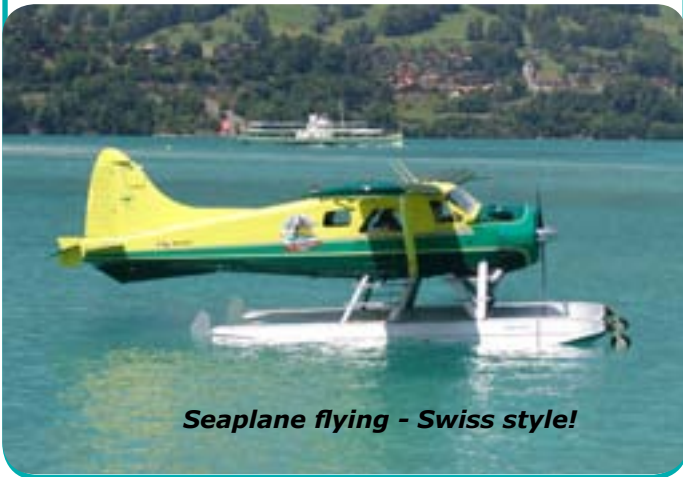
Seaplane flying - Swiss style!